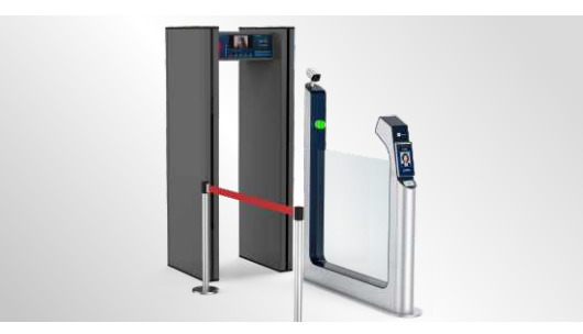
Fever detection assisted with security checking (metro stations, railway stations, airports)