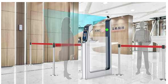
Fever detection (office buildings, shopping malls, campuses)